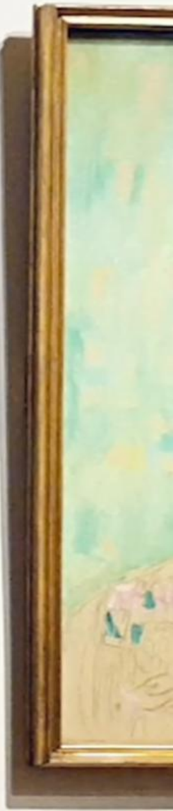
Portrait of a woman in a blue jacket and white skirt, by J.M.W. Turner, 1842. Oil on canvas, 100 x 125 cm. The painting is part of the collection of the National Gallery, London.